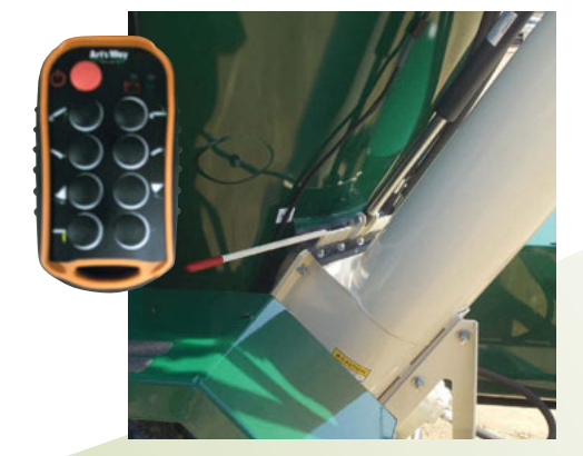
Wireless tank gate

Hydraulic lift cylinder for ease of use and less maintenance. Wireless remote control operation.