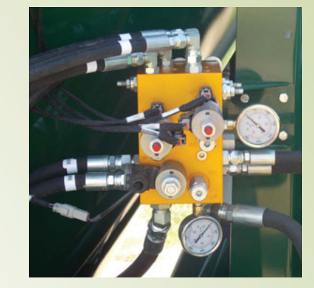
Consolidated hydraulic valve bank with soft start

Dissipates heat, decreasing fluid temperatures which maximizes tractor HP. Sight glass level and temperature gauge provides visual indication of oil levels and temperature.