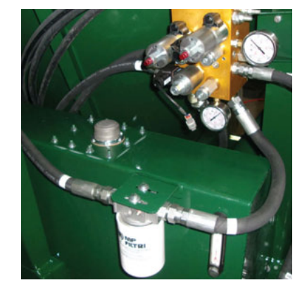
Self contained hydraulics

Fully self-contained hydraulic system with wireless remote operations.