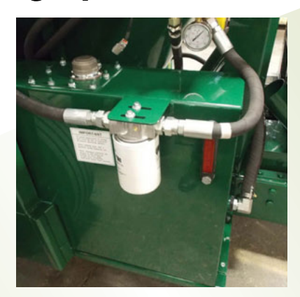
Large 36 gallon hydraulic tank

Dissipates heat, decreasing fluid temperatures which maximizes tractor HP. Sight glass level and temperature gauge provides visual indication of oil levels and temperature.