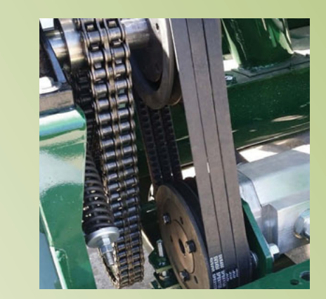
Smooth operating drive system

Provides smooth operation and easy hydraulic adjustments in one place. Pressure gauges for better monitoring/control of hydraulics.