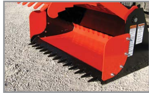
Optional bolt-in bottom of 10-gauge steel item #812265 is available. (Side plates shown installed)