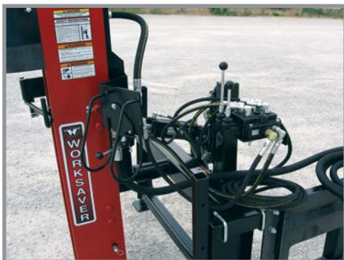
Convenient control location