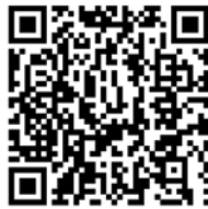
See it in action!