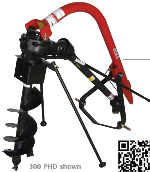
300 PHD shown with optional Parking Stand Kit

Engineered to allow the operator to dig deeper, faster and smarter, Worksaver's complete line of PTO powered diggers offer time saving convenience with outstanding reliability. Shear-bolt protected driveline is coupled to a rugged gearbox featuring tapered roller bearings and spring-loaded seals for extended service life. Large 2" output shaft has two-bolt auger connection for reliable power transfer. All job matched augers utilize fishtail center points with double flighting on the first turn for quick, positive digging action right from the start.