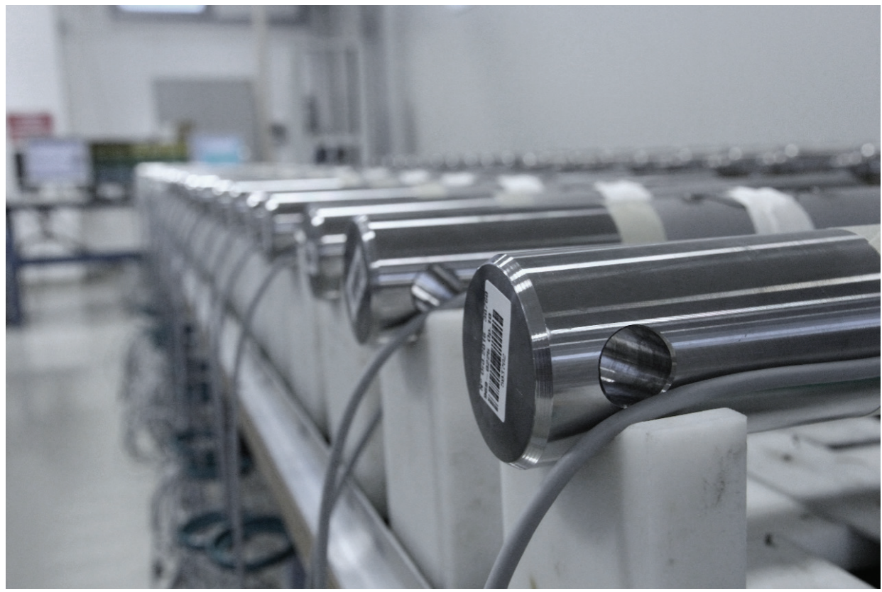
Production Testing. Dinamica Generale load cell undergoes many accuracy tests followed by stress tests prior to production completion. These standard procedures help prevent product defect before they arise and at the same time build trust and loyalty with customers.

Robustness and long-term reliability of load cells is of paramount importance for customers who are dealing with Ag applications.